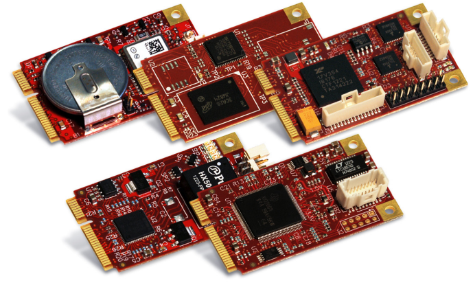
Mini PCle Modules

Call VersaLogic Sales at (503) 747-2261 for more information!