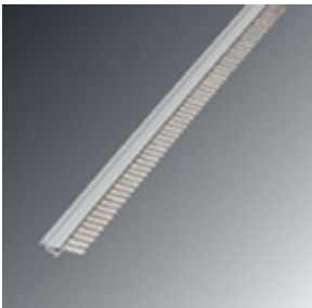
Bridge for potential distribution

Please be informed that the data shown in this PDF Document is generated from our Online Catalog. Please find the complete data in the user's documentation. Our General Terms of Use for Downloads are valid ( http://phoenixcontact.com/download )